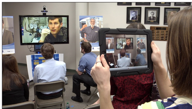
Students and teachers in Barrow County utilize teleconference technology to learn about various research sectors.

Georgia Tech and the Barrow County School System have forged a relationship during the past six years to operate a unique K-12 research partnership. The system, working with Tech, earned a $1.7 million Race to the Top Innovation grant to expand Direct to Discovery (D2D), intended to cultivate teaching collaborations between researchers and middle and high school students and teachers.