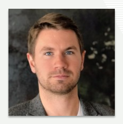
JP Peterson Phone2Action @Phone2Action