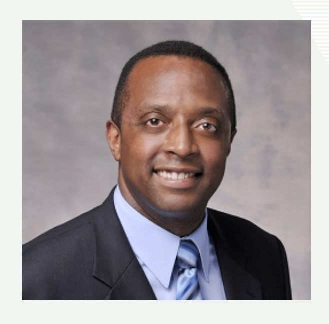
Portland State University Alumni Association @PSU Alums