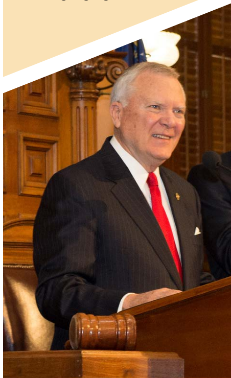
Governor Nathan Deal addresses a joint session of the Georgia General Assembly in his sixth State of the State address.